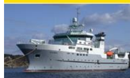
🇩🇪 G.O. Sars