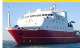
🇪🇸 Sarmiento de Gamboa